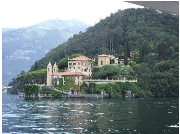
Bottom right: Estate on Isola di Comacino, the only island on Lake Como in Italy. In the 12 th century the island was ransacked and burnt by angry residents of Como. Prior to that it had been continuously inhabited since prehistoric times; therefore, it has enormous archaeological importance.