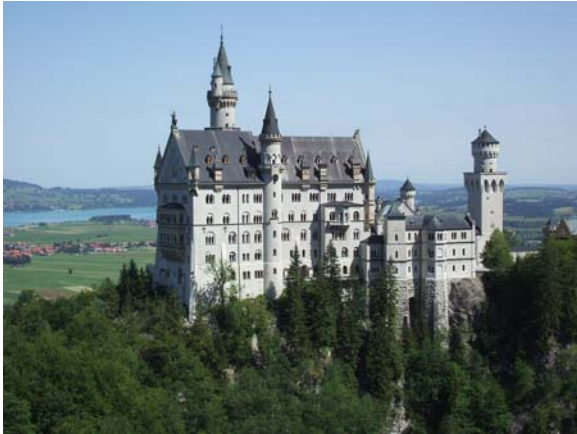
Top left: Neuschwanstein Castle, Germany. Built by Ludwig II between 1869 and 1886. Served as the inspiration for Sleeping Beauty Castle at Disneyland. Top center: Boathouse on shore of Lake Lucerne, Switzerland